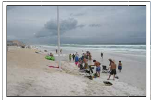
Scrambling to stay dry on Okaloosa Island