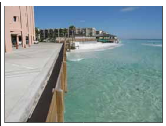
The "Beach" at Jetty East, Destin